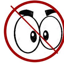
_____ (Verb) (Neg. Suffix)