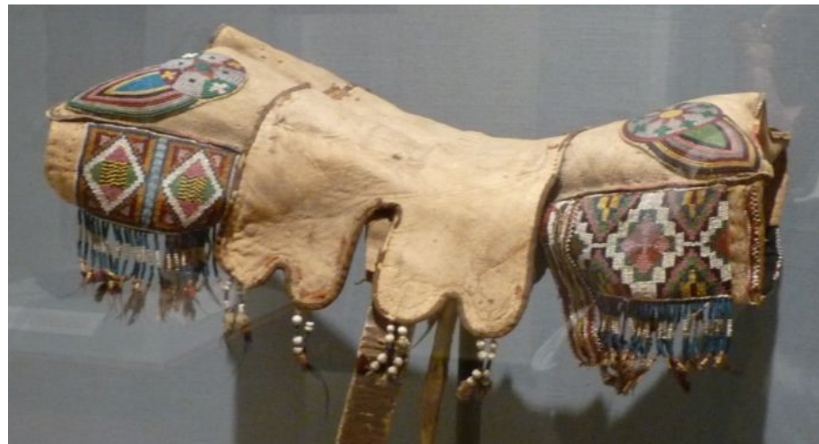
Plains Indian Beaded ná n kale (saddle)