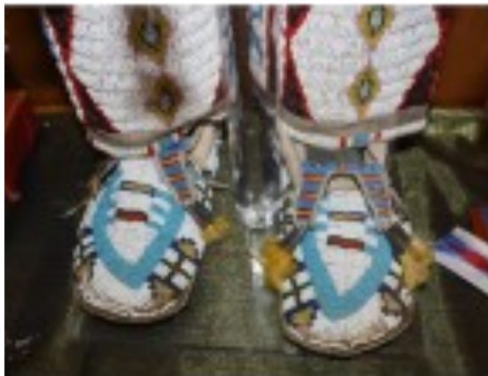
Kaá'ze Níkashí'ga ho n bé (moccasins)

After they dáble (hunted) the Cédo n ga , they tanned the hide for clothing, blankets, saddles, bags, and moccasins.