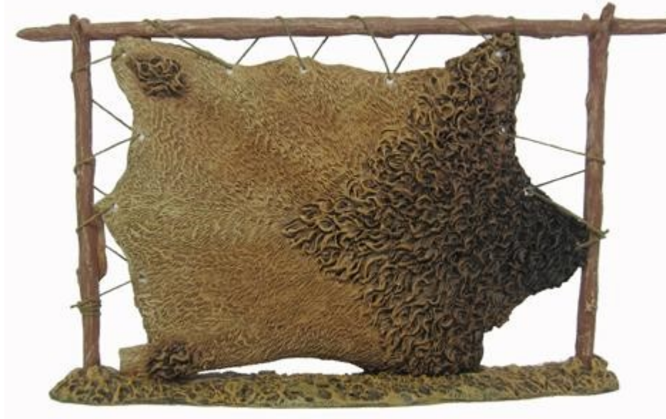
Cé dó n ha