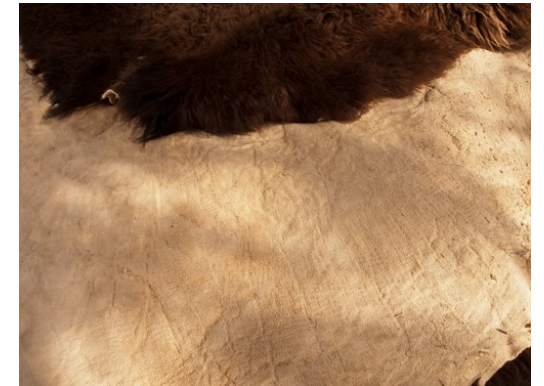
Cé dó'ha (Bison hide)